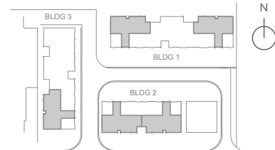
SITE PLAN A1: 5 UNITS