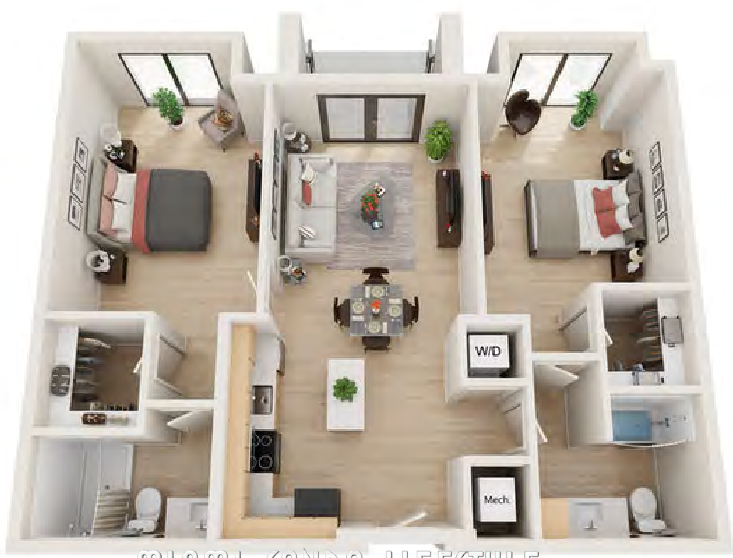
The Living II In and Supplied are Living Supara Seterence.

Features, materials, finishes and layout of subject unit may be different than shown. 3DPlans.com