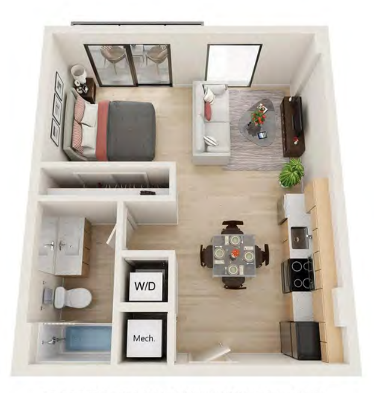
Renderings are an artist's conception and are intended only as a general reference. Features, materials, finishes and layout of subject unit may be different than shown. 3DPlans.com