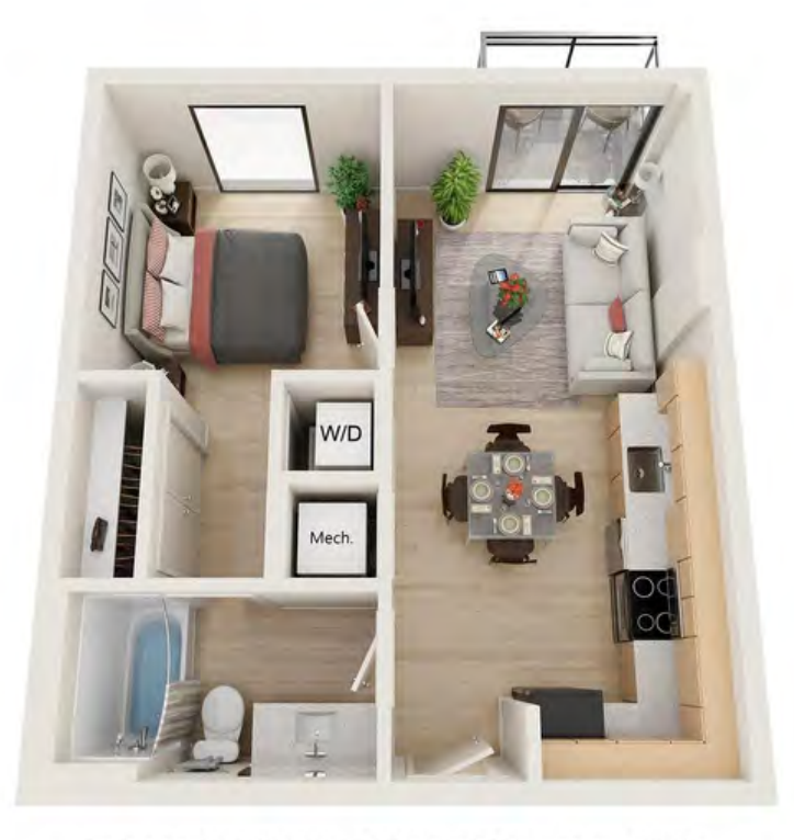
Renderings are an artist's conception and are intended only as a general reference.