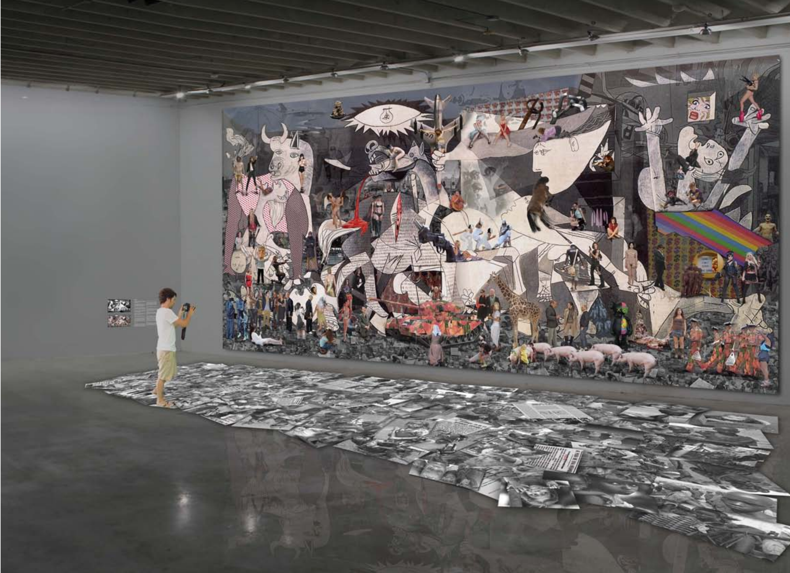
Lluís Barba Viajeros en el tiempo. Guernica. Picasso. 420 x 800 cm