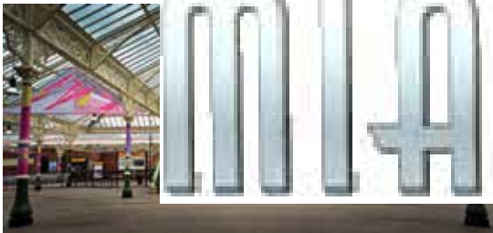
Tyenmouth Station as part of iVamos! Festival 2012, London