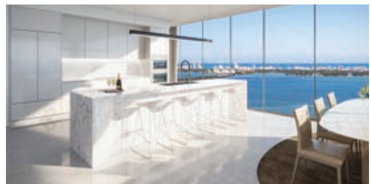
ARTISTIC CONCEPTUAL RENDERING